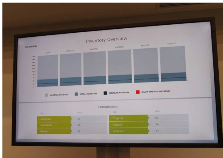
Fig. 1. Computerized possibility of individual product ordering

Technological operations are planned and conducted with the usage of the additional equipment for parts sorting, feeding devices with robots and rational organization of the field of temporary parts storage. In the machines advanced optic systems, state sensors and control systems are required [6]. They give the possibility of data transfer about the state of the machine to the Cloud. Then the communication between machines is possible (Fig. 2.) [7, 8].